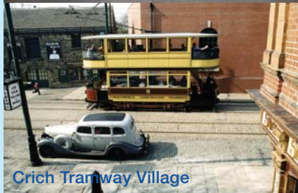
Crich Tramway Village