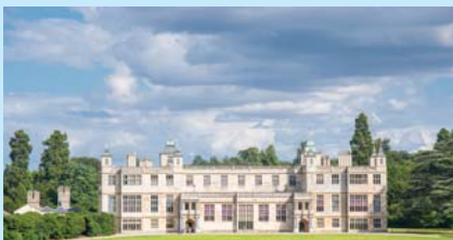
Audley End House & Gardens

Audley End House & Gardens Christchurch Mansion Constable Country – East Bergholt, Dedham & Bridge Cottage Sutton Hoo Aldeburgh The Red House Maggi Hambling's 'Scallop' at Aldeburgh beach Gainsborough's House Melford Hall Holy Trinity Church, Long Melford Anglesey Abbey, Garden and Lode Mill