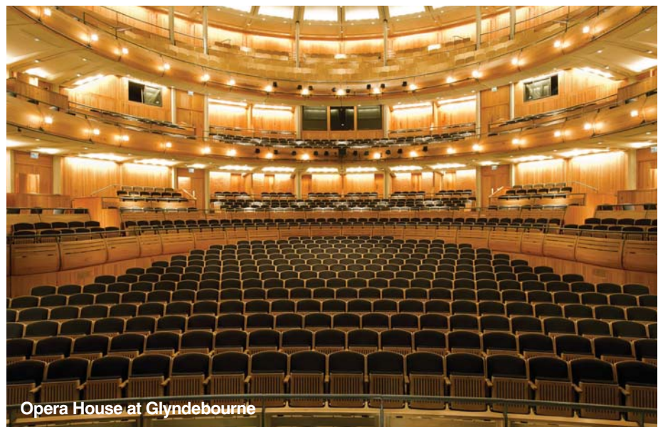
Opera House at Glyndebourne

NB:- Please note we reserve the right to alter the above itinerary if required for operational reasons. Given the historic nature of the places visited, a certain degree of walking will be involved, and this holiday may not be suitable for those with mobility problems.