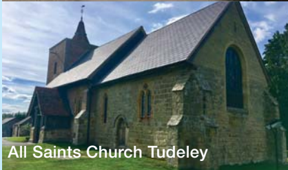
All Saints Church Tudeley