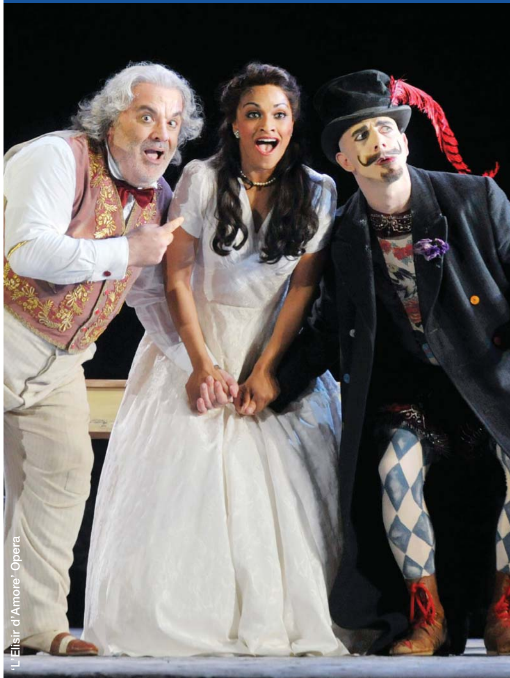
'L'Elisir d'Amore' Opera

3 days from £429 Departing 12th October 2019