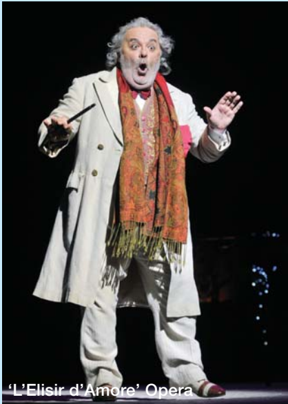
'L'Elisir d'Amore' Opera