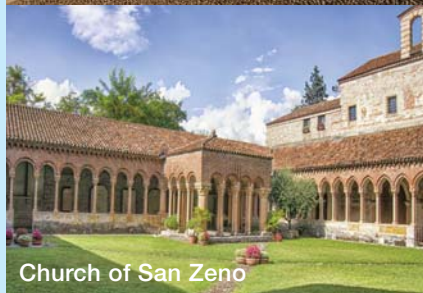
Church of San Zeno

7 days from £999 Departs 27th September 2019