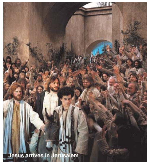
Jesus arrives in Jerusalem

This morning we visit Neuschwanstein Castle, the 'castle of the fairy tale king'. The shy King Ludwig II had built the castle in order to withdraw from public life but seven weeks after his death in 1886 Neuschwanstein was opened to the public and today it is one of the most popular of all Europe's castles. We travel on to Linderhof Palace. Built between 1874 and 1878 and the smallest of King Ludwig II's three royal castles, Linderhof was originally intended as a hunting lodge but later he declared it would be a new Versailles and the wonderful French Rococo interiors and beautiful parkland certainly reflect that ambition.