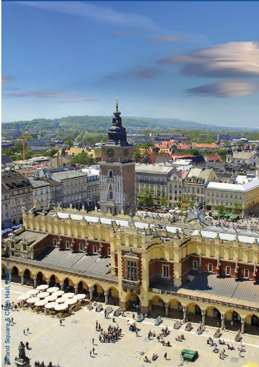
Grand Square & Cloth Hall, Krakow

Flight details may be subject to change. Price based on twin share. Minimum numbers required. Normal booking conditions apply.