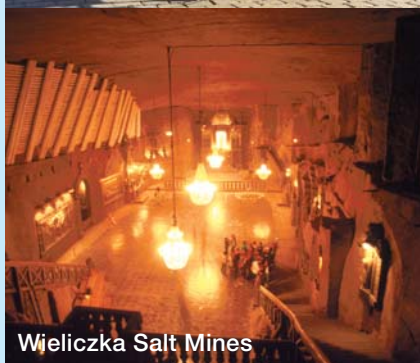
Wieliczka Salt Mines