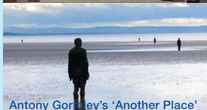
Antony Gormley's 'Another Place'