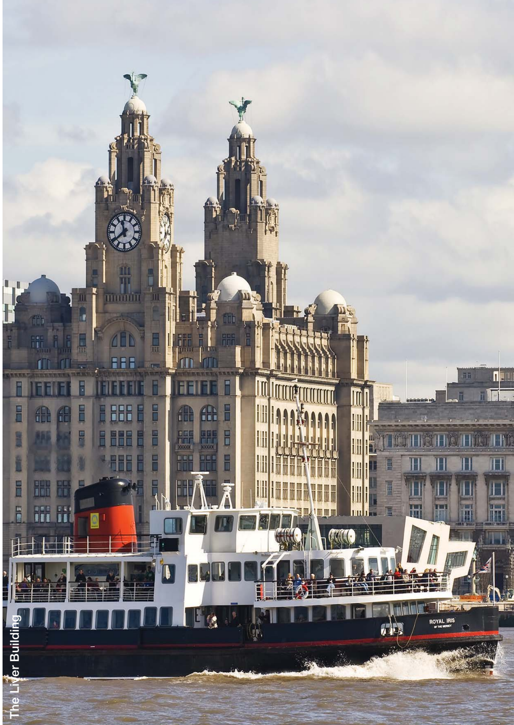
The Liver Building

Price based on twin share. Minimum numbers required. Normal booking conditions apply.