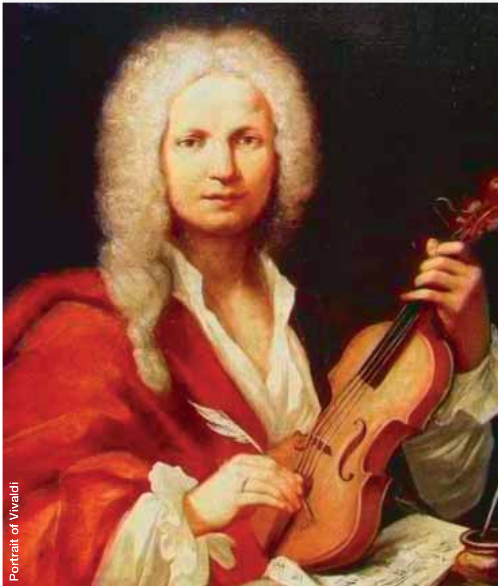
Portrait of Vivaldi

6 days from £2,669 • Departing 15 March 2018