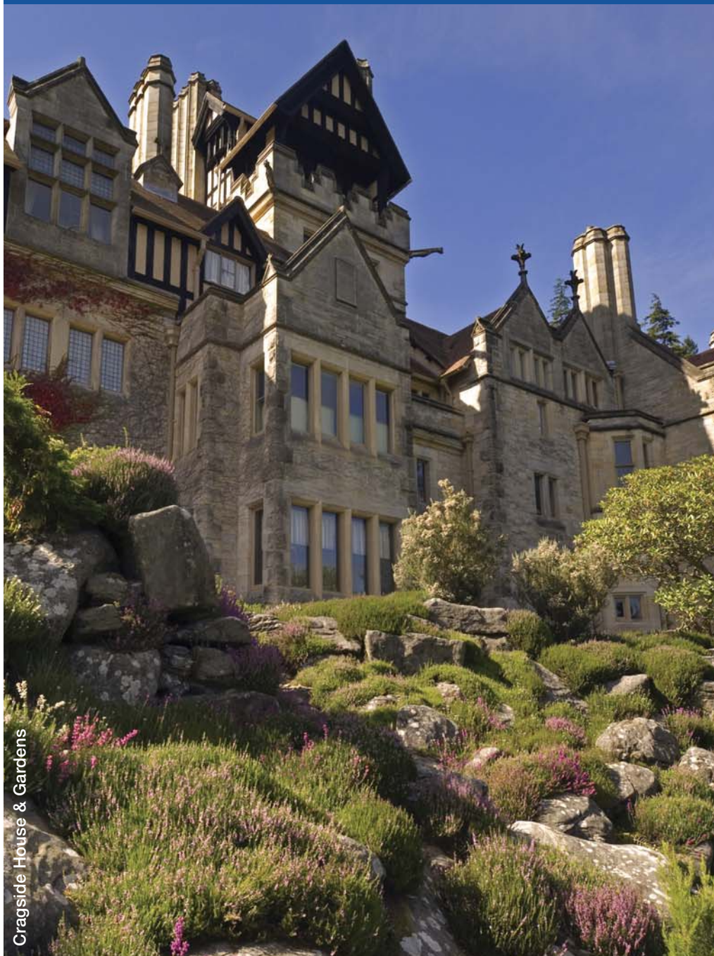
Cragside House & Gardens