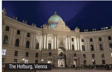
The Hofburg, Vienna

these artists were considered unfashionable. The evening is at leisure, or people may wish to attend an opera or concert or enjoy a stroll and a glass of Glühwein in one of the Christmas markets.