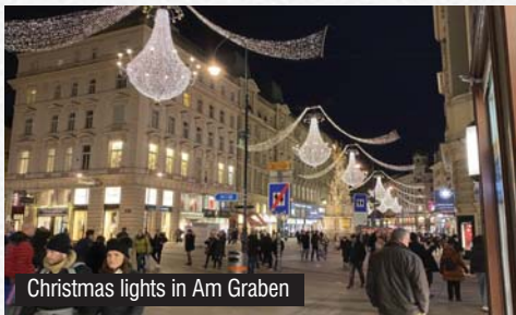
Christmas lights in Am Graben