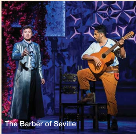
The Barber of Seville

Our Glyndebourne odyssey begins at Victoria Coach Station where we meet our executive coach and make our way to the 4* Spa Hotel in Tunbridge Wells for a four night stay. En route, we take in a guided tour of Eltham Palace, which was the childhood home of Henry VIII. However, the Tudor palace now incorporates what is regarded as the best example in Britain of an Art Deco house. This was built by the Courtauld family and has interiors that show the glamour and allure of 1930s high society. We follow our visit with an included lunch before travelling on to our hotel in Tunbridge Wells. A private drinks reception this evening at the hotel is followed by dinner.