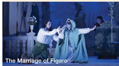
The Marriage of Figaro

Price based on twin share. Minimum numbers required. Normal booking conditions apply.