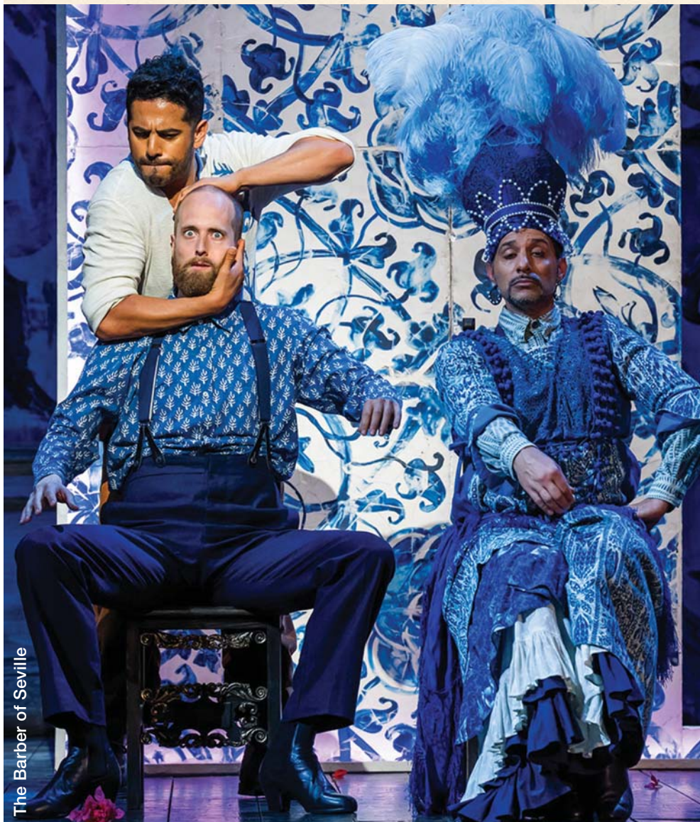
The Barber of Seville