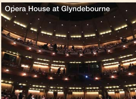
Opera House at Glyndebourne