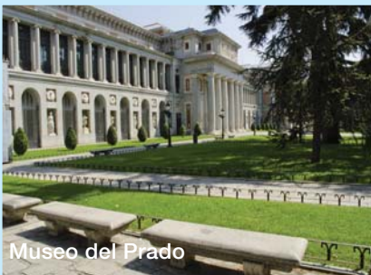
Museo del Prado

NB:- Please note we reserve the right to alter the above itinerary if required for operational reasons. Given the historic nature of the places visited, a certain degree of walking will be involved, and this holiday may not be suitable for those with mobility problems.