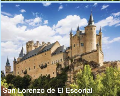
San Lorenzo de El Escorial